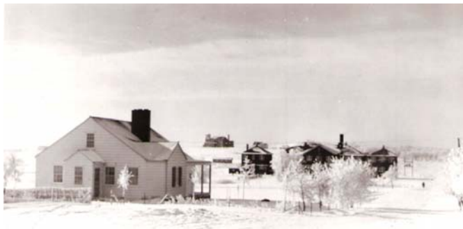
[Turtle Mountain Agency of the BIA, 1938]

The Turtle Mountain Tribe has existed as an autonomous government within the United States because early treaties recognized the Band's sovereignty. The United States government promised "health, education, and welfare" in exchange for aboriginal lands. This unique relationship gives rise to several institutions that manage these services including the Bureau of Indian Affairs and the Indian Health Service. These institutions are the major employers on the reservation, with over 600 teachers, nurses, bus drivers, mechanics, road workers, janitors, cooks, policemen and others.