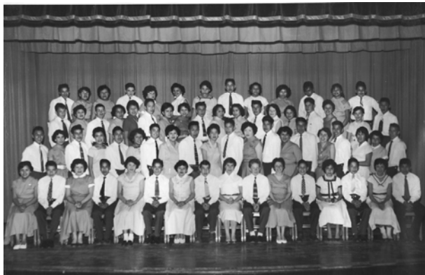
[Wahpeton Indian School Students 1956]

In 1882, a federal act authorized the use of any abandoned military facilities for the education of Indian children. Many Belcourt children were forced into boarding schools at Fort Totten and Wahpeton, North Dakota, and Marty, Flandreau and Pierre, South Dakota, Chemawa, Oregon and boarding schools in other states.