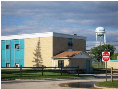
[Turtle Mountain Agency of the BIA, 2007]

protecting water and land rights, developing and maintaining infrastructure and economic development. It oversees about 600 federal employees in the local schools, hospital, road and police departments. (personal communication with Davis 2007)